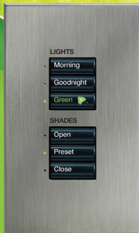
New! seeTouch® keypad with green setback function

We now offer Vacation Mode Trim, which can be programmed to trim back lighting by an added amount—reducing energy use. It also allows playback of lighting events that happen only at night.